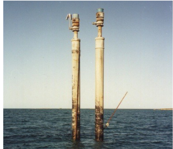
A pair of "Minnowpod" conductors, completed and suspended, awaiting installation of topsides

Topsides modules have also been developed for both single and dual well configurations.