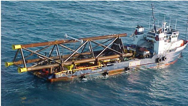
Transport vessel standing by, prior to lift

ICON's scope covered design assistance, installation procedure development and all installation works.