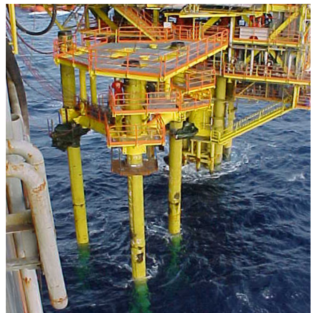
The completed BKA annexe platform