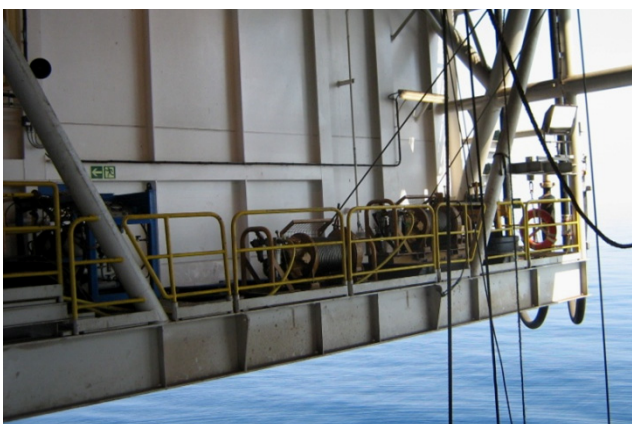
Installation of three guide wire winches - one port, two starboard

Padeyes and rigging were installed beneath the drill floor in order to run the guide wires up and out from the cantilever cellar deck down to the Texas deck. Other modifications included installation of a tubing hanger plinth and installation of spreader beams on the Aft main deck to land out the tree.