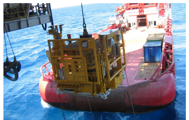
Lifting of tree from supply boat using top drive

The subsea tree was lifted from the supply boat using the top drive with the cantilever deck skidded out past well centre. Again, specialised slings and rigging were designed to undertake this lift. The tree was landed out on the main deck below the cantilever on spreader beams.