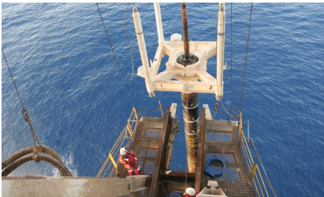
Modifications to Texas deck, guide wires also shown

The modifications to the Wilcraft included installation of three guide wire winches on the cantilever cellar deck, and modification to the Texas deck to enable cantilever skidding while 30" casing was fitted to the PGB, to allow the PGB to pass below the Texas deck.