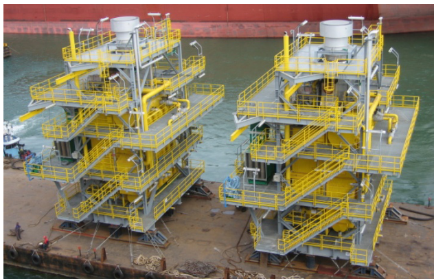
Aalborg boiler modules for Cidade de Sao Mateus FPSO

A total of six boiler modules for Prosafe were fabricated in Singapore and two each installed on the Azurite FDPSO, Ningaloo Vision FPSO and Cidade de Sao Mateus FPSO respectively. The other two boiler modules for Talisman were also fabricated in Singapore and installed on the Orkid FSO in Malaysia.