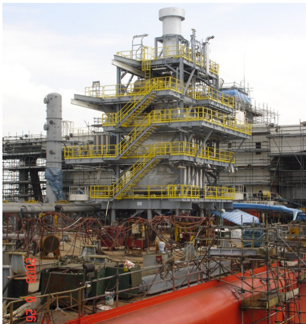
Aalborg boiler module installed on Azurite FDPSO

The boiler module design was simple in appearance but robust and catered to the client requirements for providing access to all major valves, fittings and openings on the boiler.