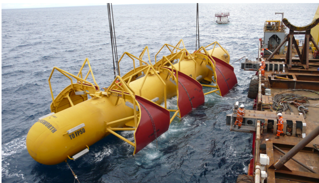
Pyrenees Mid Water Arch

The mid water arches are 3.9m in diameter and span over 38m with each buoy providing 200t of net buoyancy. The design itself needed to satisfy both the pressure integrity requirements for the buoy shell, heads and internal ring stiffeners as well as the structural design requirements for arches and gutters.