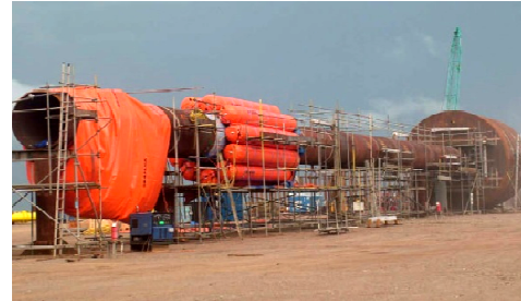
Monopod prior to sailaway

The lateral braces were installed first, pinned to the jacket and temporarily supported using slings back to the topsides. The monopods were floated out to location, upended by a crane barge and located into the open guide clamps. An option existed to use ballast tanks to upend the monopods and float them into position. However in this instance TML had the services of a crane barge therefore this was not required.