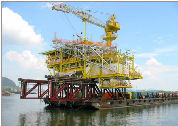
WP-PA Topsides after Loadout – Inboard Transport Position

The barge anchoring, positioning, floatover and docking operation was completed within eight hours of the barge arriving in the field.