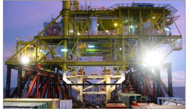
View of Floatover Operation from Barge Deck (Jacket is White)

ICON was engaged at an early stage of the platform design to conceptualise and confirm feasibility of the floatover method. The design incorporated all the necessary features to allow both crane barge or floatover installation. The final installation method was then chosen on the basis of lowest risk and cost. The decision to proceed with the floatover method was made on 15 November 2002, the installation occurred five months later. ICON carried out all the engineering associated with the floatover, supervised loadout jointly with Murphy's chosen fabricator in Lumut and performed the offshore installation. The project represents the first of a series of minimal deck floatover installations planned by Murphy in Malaysia.