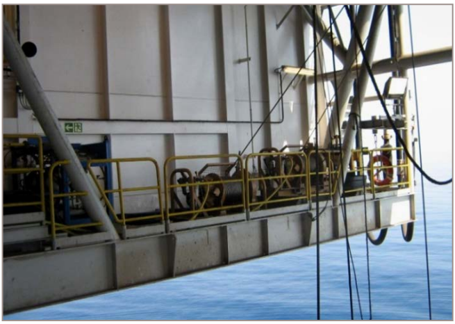
Installation of three guide wire winches - one port, two starboard

Other modifications included installation of a tubing hanger plinth and installation of spreader beams on the Aft main deck to land out the tree.