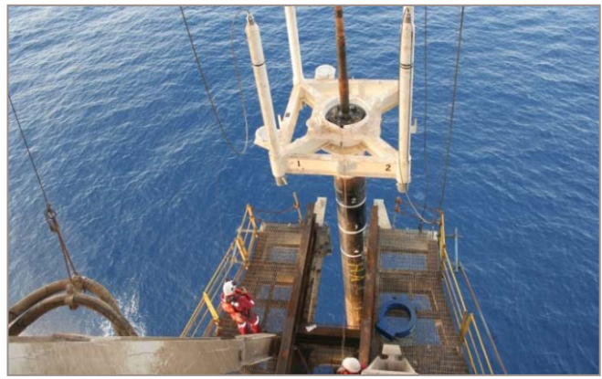
Modifications to Texas deck, guide wires also shown

The modifications to the Wilcraft included installation of three guide wire winches on the cantilever cellar deck, and modification to the Texas deck to enable cantilever skidding while 30" casing was fitted to the PGB, to allow the PGB to pass below the Texas deck.