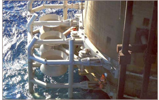
Completed conductor guides and riser protection

Analysis of the structure determined that the preferred solution was to use rigid conductors supported at water level by a conductor guide which also provided boat impact protection to the conductors. The module extension was designed to be installed in pieces limited by the platform crane capacity of approximately 8 tonnes at the desired radius.