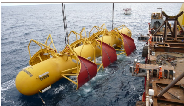
Pyrenees Mid Water Arch

The mid water arches are 3.9m in diameter and span over 38m with each buoy providing 200t of net buoyancy. The design itself needed to satisfy both the pressure integrity requirements for the buoy shell, heads and internal ring stiffeners as well as the structural design requirements for arches and gutters.