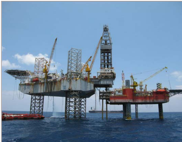
Similar Development Illustrating the use of a WHSF

The wellhead support frames will receive the full well stream production (FWS) from the D30 and Dana reservoirs and transfer it to basic Mobile Offshore Production Units (MOPUs) that will be connected to each of the WHSFs. Production from the D30 and Dana MOPUs will then be further exported via a new pipeline to the existing D35 processing platform for processing. Production will be commingled with the existing D35