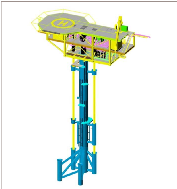
4 pile monopod

The project was deferred when it was determined that further appraisal drilling was required before the project could be sanctioned. Unfortunately, a subsequent appraisal well failed to prove up the necessary reserves and the project was cancelled.