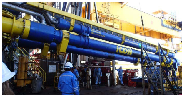
The ARTP E-Series during rig up in the derrick

The ARTP E-Series was originally designed for another rig, so a rig interfacing scope was required to ensure compatibility with the Atwood Osprey. This included modifying the ARTP dolly guides to suit the rig's dolly track, developing deck layouts and umbilical routing plans, seafastening the deck equipment via an interface grillage, supplying new air hoses, umbilicals and service loops, and tie-in to rig utilities. All deck equipment and umbilicals / hoses were pre-installed and hooked up in advance to save time on critical path.