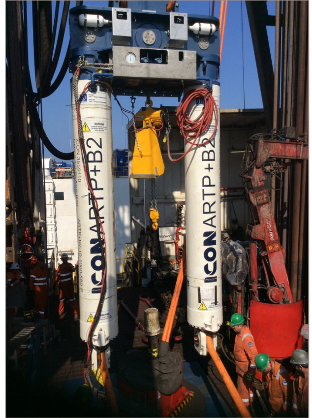
The ICON ARTP B-Series pictured during rig up.

The ICON ARTP B-Series is available as an in line single cylinder module for use with the ICON tension frame, or as a dual cylinder, single integrated unit.