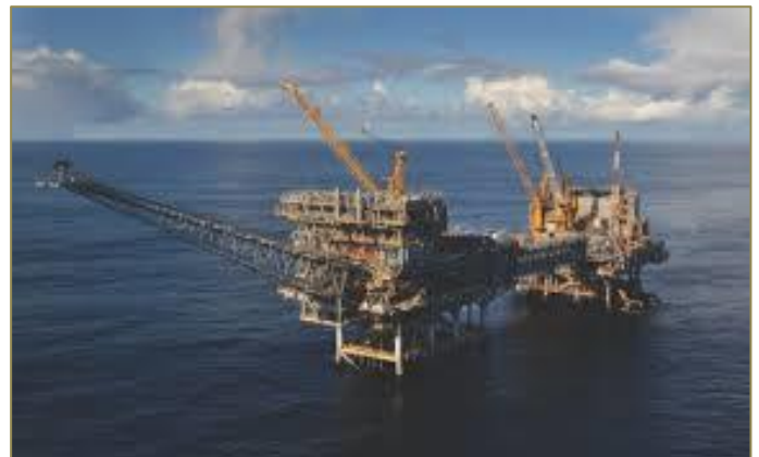
Marlin B Platform