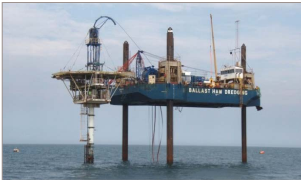
CT Barge operating at Yammaderry platform

Following fit-out of the CT spread, a 15t stiff leg derrick crane and sundry 3 rd party items in Dampier, the 'BHD Supply' was towed to the Yammaderry platform by tug, where after mooring, it was jacked up adjacent to the platform for the CT operations.