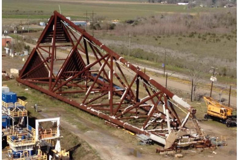
The existing jacket

TOPIC planned to use the jack-up rig, JAWHARA 5 (J-05) (ex- ENSCO 60), which was to be converted and upgraded to be capable of both drilling and production activities as a MODPU (Mobile Offshore Drilling & Production Unit). With ICON's assistance, it planned to repair and modify the TP01 (ex-West Cameron 600A) Tripod Jacket to support a new-build topside facility accommodating four wellheads and associated equipment.