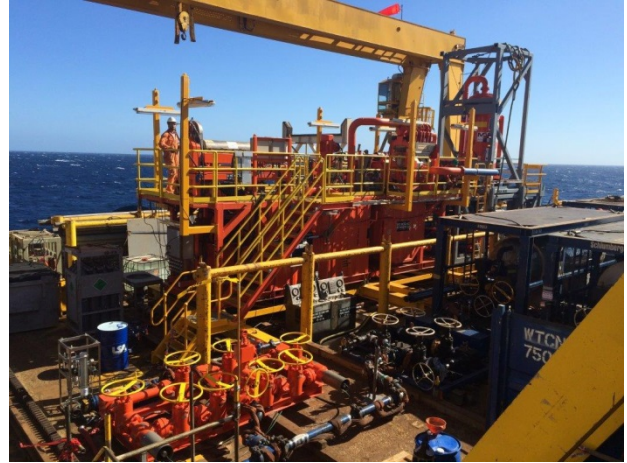
The PFMS installed on the Atwood Eagle

The project included the project management, engineering, fabrication of steelwork, skids for pumps and degasser frames, transportation and offshore installation.